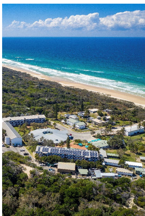
Eurong Beach Resort: Situated right along 75 Mile Beach, tour guests overnight here, ready for day two of their island adventure.