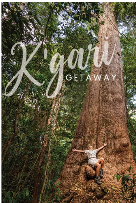
NEW: Three-day, two-night guided 4WD tour itinerary offers a local, curated adventure on Fraser Island.