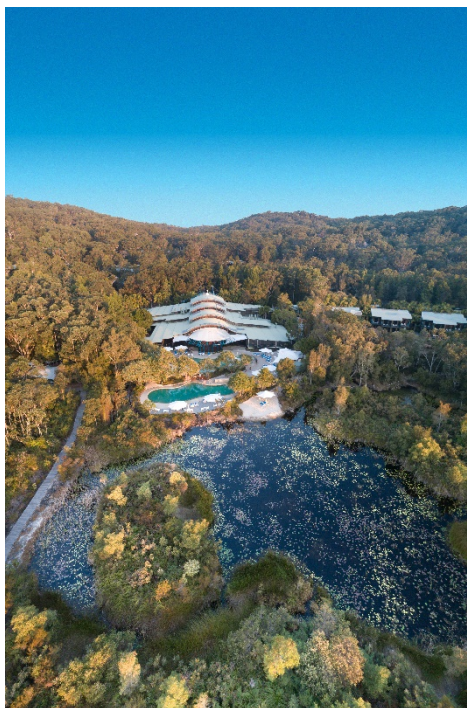
Kingfisher Bay Resort: Located on the western bay, Fraser Island's four-star ecotourism resort is the base for the tour's pre-night accommodation.